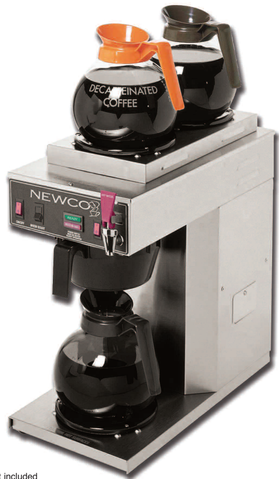
Decanters not included

All the features are built into a stainless steel cabinet for long stability and durability.