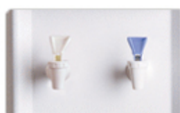
Cook & Cold water faucet