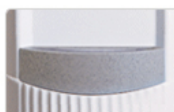
Removable drip tray