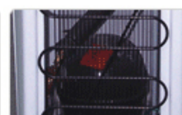
Hermetically sealed reciprocating Compressor